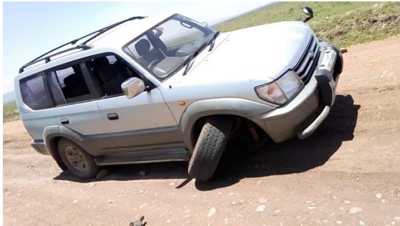
This had to be left on the road for 2 days whilst we were awaiting parts from Nairobi

Our Van has just been to Nairobi where we have had to do $800 of repairs to it to ensure it is ready for school again on Tuesday. These costs are not covered in any of the running costs at present so is another urgent need to ensure we can run the vehicles each day.