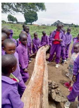
Class 1 visiting a local farm to see the variety of different activities you can have