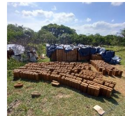
Materials and Bricks ready to start work as soon as funds are received