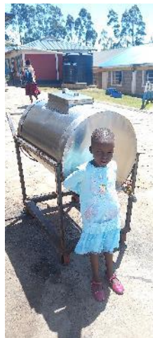
This is the tea urn for many students - one of a number

If you would like to be part of this exciting work please set up a regular donation directly into the KINI bank account (details below) or through RAWCS ( www.kinikenya.com ) if you would like a tax deductible receipt.