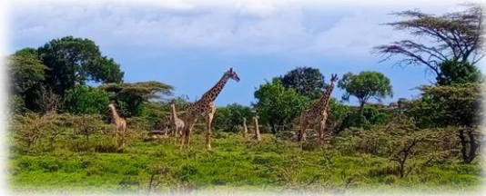
Makes the drive better