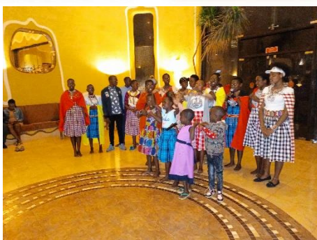
Singing "We are KINI Kids"