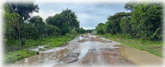
River or Road??