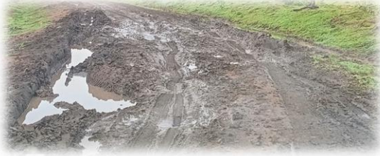
The scariest part of the road

Living your dream always sounds like a wonderful life full of happy times and fun. But sometimes it is hard work and scary moments which make you feel most uncomfortable, sometimes you feel like you never want to get out of bed. But when you see lives changed it is all worthwhile!