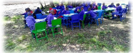
Class 2 under the trees until their room is ready

Building works have been going on but have stopped due to the lack of funds to finish the roof, water tanks and other finishings. Prices have skyrocketed with the change in Government so it will cost $20,000 to completely finish the 3 classrooms.