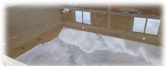
With no roof the rooms are our swimming pool!