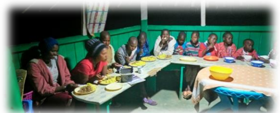
Half of the children when we are all home.

When a grandmother is given children (which often they are) to care for, they are wholly responsible for that child, including education fees. This grandmother had 3 children to care for and no income. KINI has been helping educate 2 of the children over the last few years and this week she came bearing gifts of a sheep and a shuka (a Maasai way to say thank you in a big way). It is beautiful to see the impact KINI has on families and especially grandmothers who want their grandchildren to be educated.