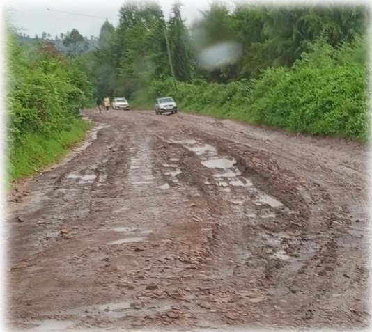
Rough and now muddy in the rain