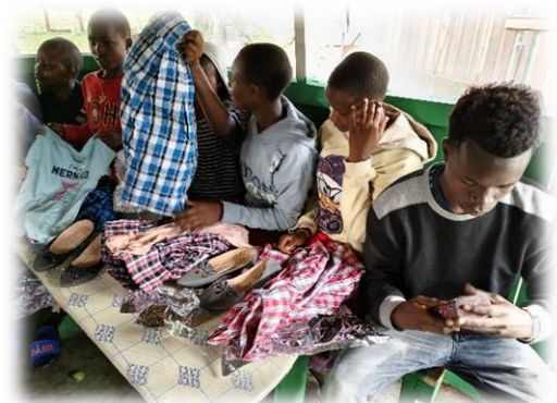
Christmas morning presents