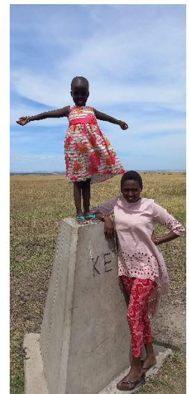
Looking towards her homeland of Tanzania where she cannot return for fear of being circumcised and being forced to marry