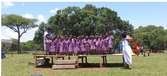
PP1 singing and reciting poems