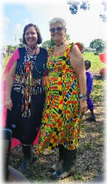
Note the beautiful footwear 😊