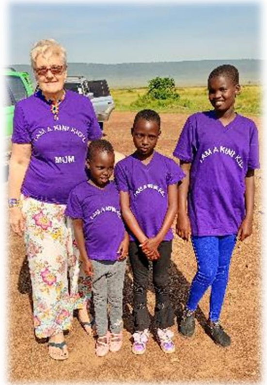
My 3 babies "KINI Kids"