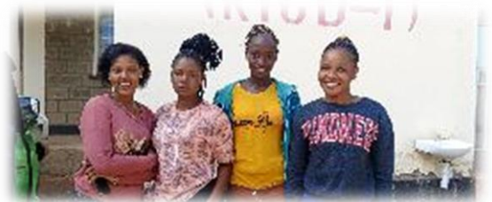
3 more girls were put into college to enable them to have more opportunities for jobs in the future