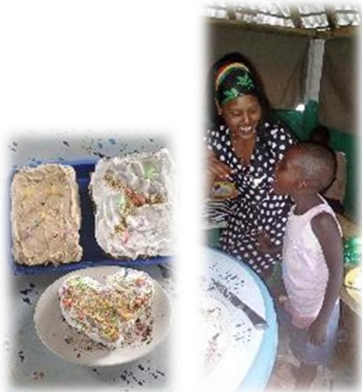
January is birthday time for many children