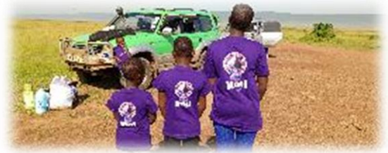
A lovely drive through the Mara to the Hotel