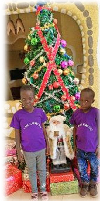
Christmas Day for the children