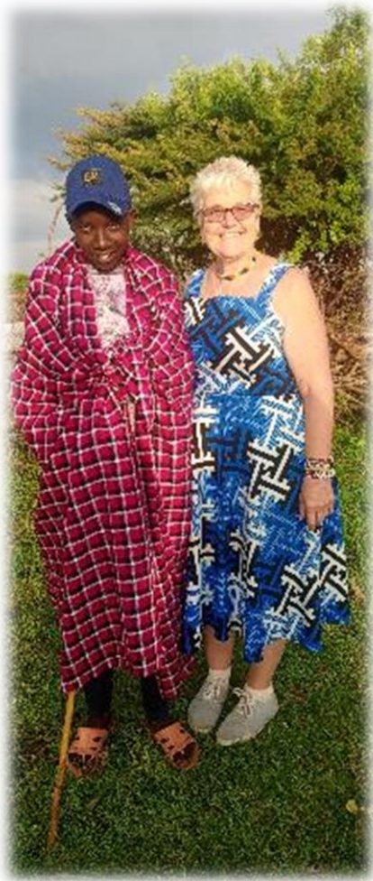
One of my bigger boy's special celebration into manhood in December